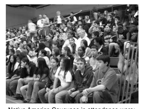
Native Americn Caucuses in attendance were: Lincoln High (hosts), North Star, Bryan Community, Culler, Dawes, Park, and Southeast.