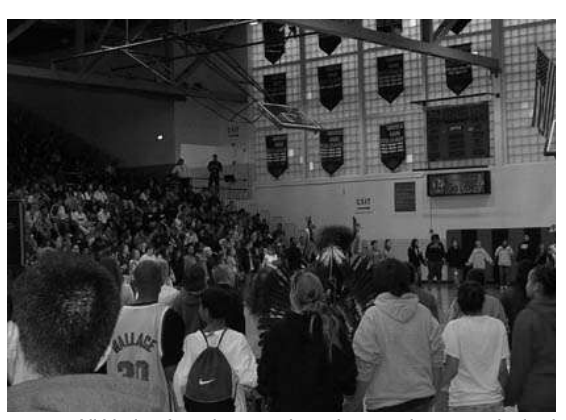
All Native American students in attendance are invited to join each other on the floor for the final dance. Many students from each caucus brought their own regalia and shared their dances and culture with each other.