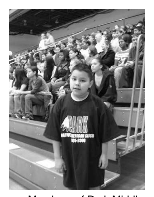
Members of Park Middle School show their Native Pride with caucus t-shirts!

37 members of Dawes Middle School Native American Club about to