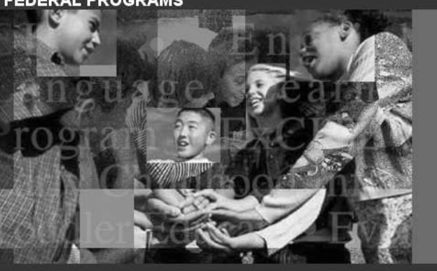
The Federal Programs Office exists to advance the mission of Lincoln Public Schools. It is a repository and dispenser of information regarding funding opportunities and encourages staff members to develop and carry out projects that promote the district's goals. The Federal Programs office personnel advocate for and provide support and administration in developing and submitting proposals and conducting funded projects.

The new Indian Education website has been created to inform students, families and faculty about Native American scholarship opportunities, LPS Native American student scholarship recipients, Native American news locally and around the country, school and Native American community events and announcements, community resources for families in need of assistance and access to past and newly released Indian Education newsletters. It's quick to access and right at your fingertips at school, home, work or wherever there is a computer! Go to www.lps.org, click on Instruction in the top gray bar, click on Federal Programs, click on Indian Education and you're there!