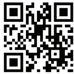
LNE Home Page